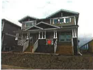
24 homes Pineridge, Calgary