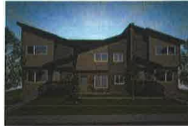
25 homes Bowness, Calgary