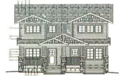
32 homes Silver Springs, Calgary